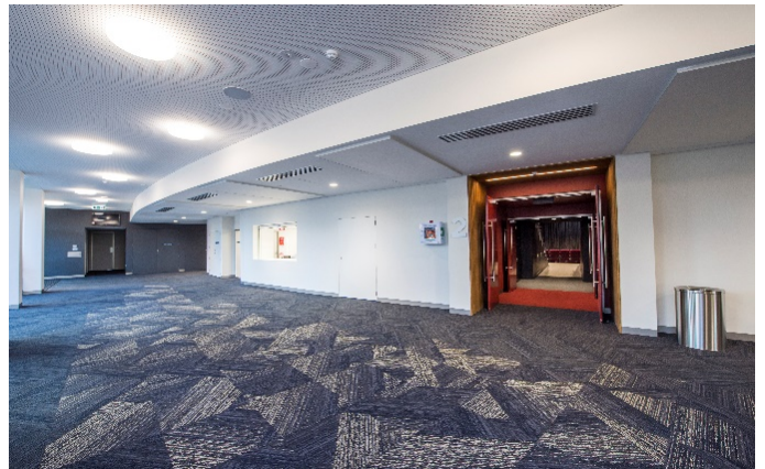
AVL CONTROL ROOM